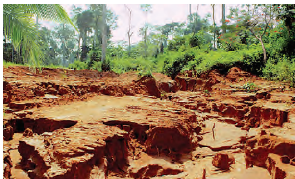
2.2.1 Mountain slopes, streams, deforestation and water and soil carried away due to them.

"Water Conservation" is the use of man-made measures to block, store and intake the rainwater in an area by constructing various structures and allowing it to be used for drinking, consumption, industry and agriculture until the next monsoon.