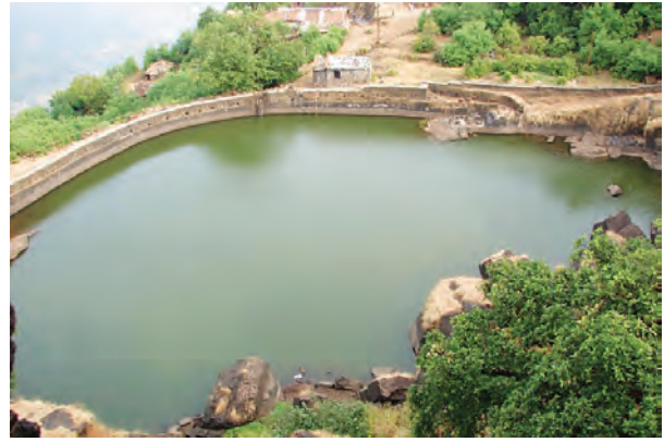
2.2.6 Lake at Raigad fort

parts of the country. Water conservation and management measures are also used in places like Naldurg or Onsa on land, most of the hill forts in Maharashtra as well as sea forts. Here too, while constructing the ramparts of the fort, care was taken that the rain water falling in the vicinity of the fort would not be carried out. This water was infiltrated into the area, then used for wells and stored in ponds or tanks. Even today we see this system working properly. Using this principle, fresh water was provided by water conservation and management even on marine forts.