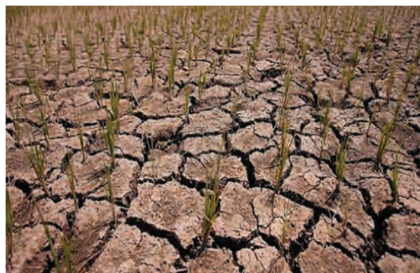
2.2.2 Problems arisen due to lack of water conservation.