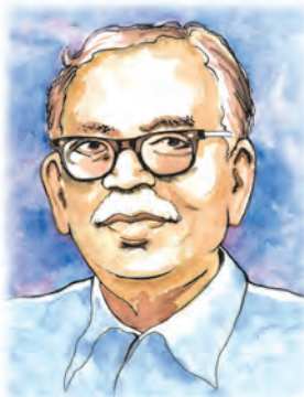
Dr D. S. Kothari