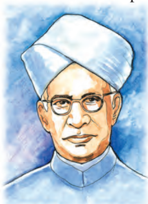
Dr Sarvapalli Radhakrishnan

Education in the post-independence era : After independence, in 1948, the