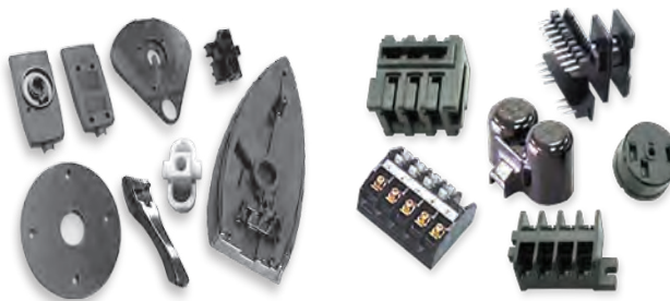
17.3 Thermosetting plastic