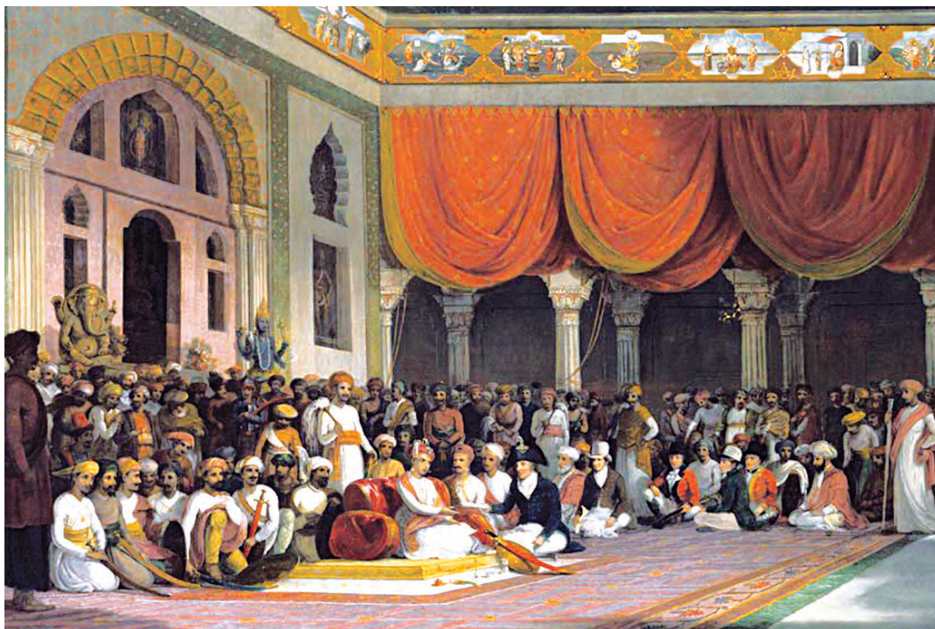
The Court of Sawai Madhavrao Peshwa