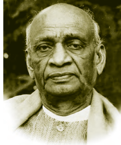
Sardar Vallabhbhai Patel