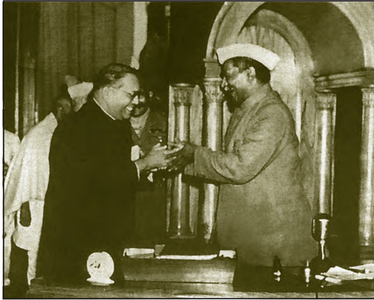
Dr Babasaheb Ambedkar presenting the draft of the Indian Constitution to Dr Rajendra Prasad, President of the Constituent Assembly