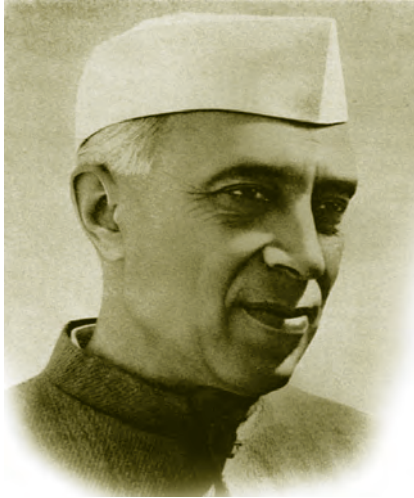
Pandit Jawaharlal Nehru

according to the provisions of the Constitution from 26 th January 1950. The Indian Republic came into existence from this day. Therefore, 26 th January is celebrated as ‘Republic Day.’