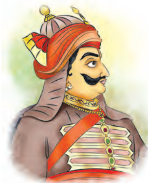
Maharana Pratap for Mewad's existence. Till the very end, he struggled with Akbar to maintain his independence. He has become immortal in history due to his qualities of valour, courage, self-respect, sacrifice, etc.

Chandbibi : The Mughals attacked Ahmadnagar, the capital of Nizamshah's kingdom, in 1595 CE. The Mughal army put the fort of Ahmadnagar under siege. Chandbibi, the capable daughter of Husain Nizamshah of Ahmadnagar, bravely defended the fort. At this time, there was an internal strife among the factions of the Sardars in Nizamshahi's kingdom. This resulted in the murder of Chandbibi. Later, the Mughals captured the fort of Ahmadnagar. But, the Mughals could not bring the entire kingdom of Nizamshahi under their control.