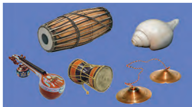
Vedic musical instruments

Singing, playing musical instruments, dance, board games, chariot-race and hunting were the means of recreation. Their main musical instruments were veena , shat-tantu , cymbals and the conch. Percussion instruments like damru and mridanga were also used.