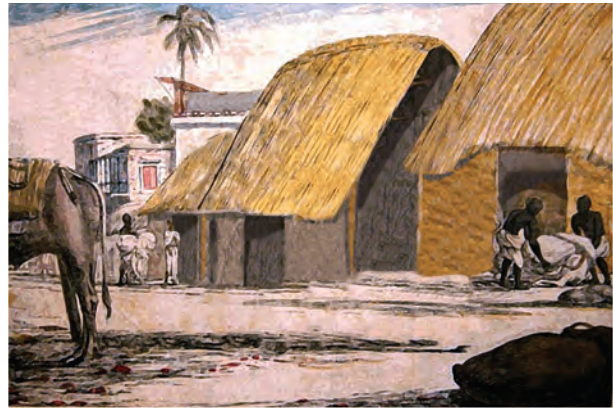
Houses in the Vedic period

be found in the Vedic literature. Yava means ‘barley’, godhoom - wheat, vrihi - rice. The