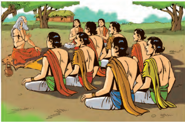
Guru and disciples

expected to detach himself from the household, retire to a solitary place and lead a very simple life. The fourth stage was the sanyasashrama . At this stage, the convention was to renounce all relations, lead life in order to understand the meaning of human life, and not stay in one place.