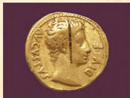
A gold coin of the Roman Emperor Augustus found at Arikamedu

Around the first or second century CE, trade between India and Rome flourished. The ports in South India also had a large share in this trade. Some articles made of bronze were found in the excavations at Kolhapur. They have been made in Rome. The excavations at Arikamedu in Tamil Nadu have also brought to light many articles made in Rome. Both these places were important centres of trade between India and Rome. Many such trade centres are mentioned in the literature of those times.