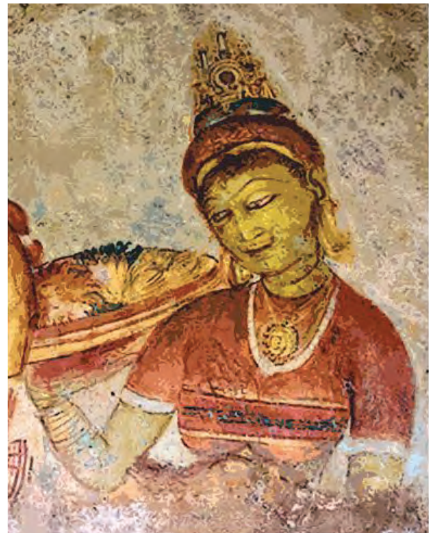
A wall painting in the Sigiriya caves

Many countries in Asia were greatly influenced by the Indian culture of those times.