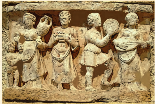
A sculpture in the Gandhara style on a stupa at Hadda in Afghanistan. (Greek costumes, amphora and musical instruments)

The facial features of the statues made in this style are similar to those of the Greek people. The early coins that were minted in India were also like Greek coins.