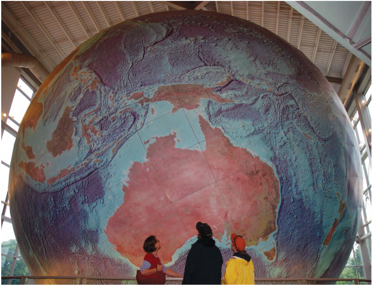
Figure 3.2 : Eartha

Maine in the United States of America. The rotation and revolution speed of this globe is maintained as per that of the earth.