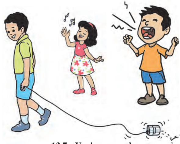
13.7 : Various sounds

A loud sound is harsh to the ear. Such sounds produce noise.