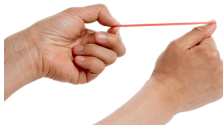
13.3 : A stretched rubber band

Apart from the movement of the rubber band, what else did you notice?