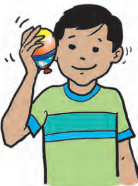
13.6 : Propagation of sound