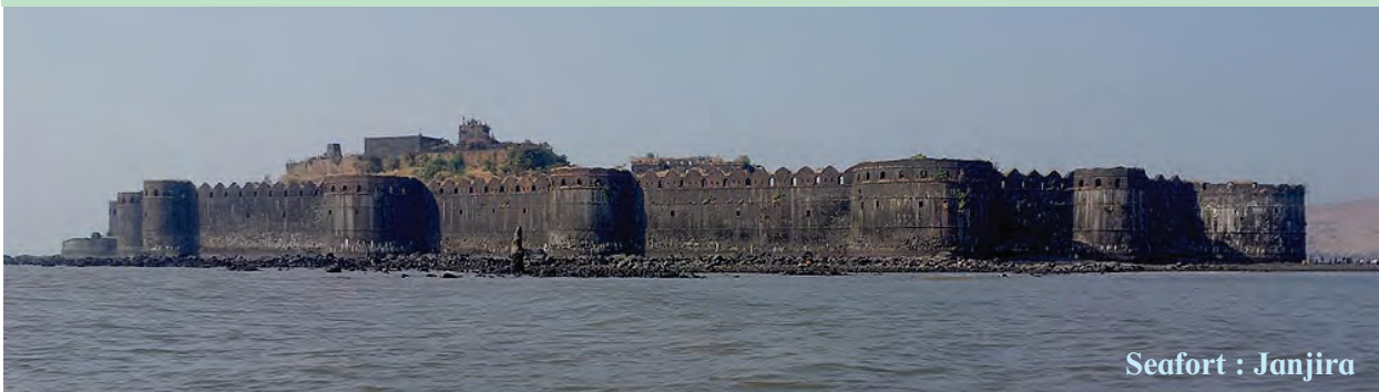
Seafort : Janjira

All these islands have strategic locations from the defence point of view. Long ago, forts were built on some of these islands off the coast of Maharashtra to safeguard the coast. These historical forts are known as sea forts. We can see several such forts along the Konkan coast.