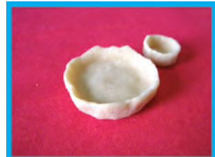
plate and bowl