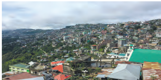
Urban Community has a dense population

An urban area or urban agglomeration is a human settlement with a high population density and infrastructure of built environment. Urban areas are categorised as cities, towns or suburbs.