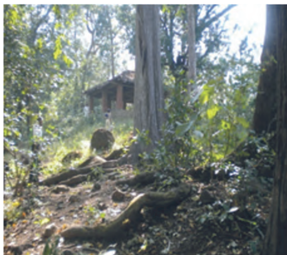
“Shedoba cha van” (Forest of Shedoba) Sacred grove in Murbad Taluka, Dist. Thane