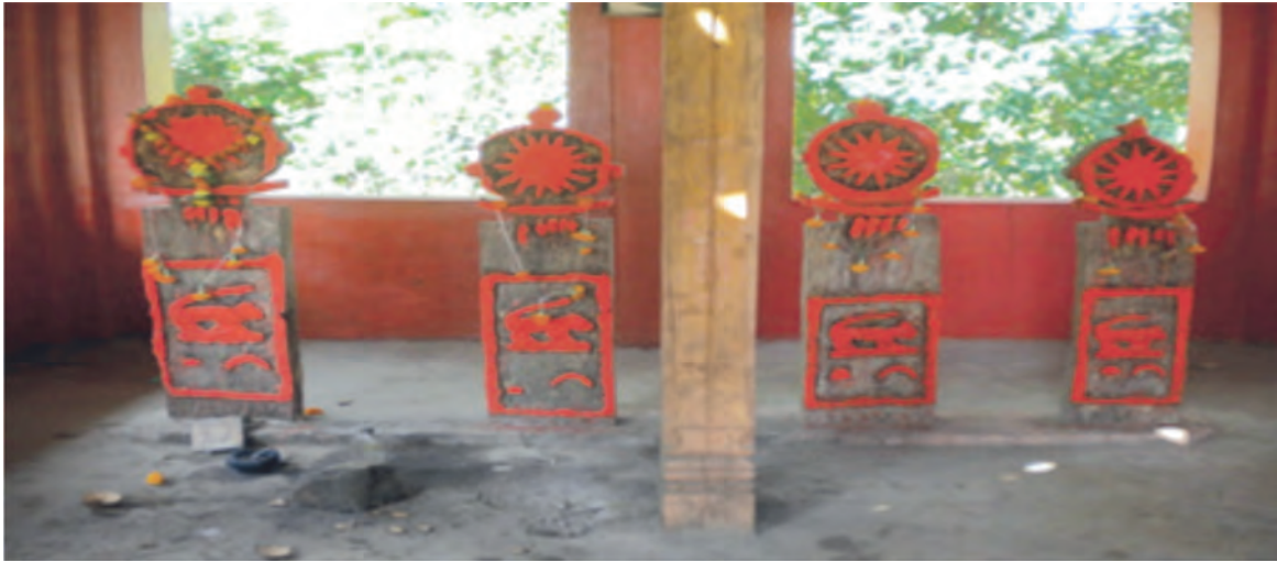
“Waghoba Mandir” (Temple of the Tiger God) at Kasatvadi Village, Jawhar Taluka, Dist. Palghar

‘tribal panchayat’, family and kinship ties. The authority of the Tribal Chief and Council of Elders was the governing body of each tribe. Today however, this autonomy of the traditional authority vested in tribal chiefs has weakened.