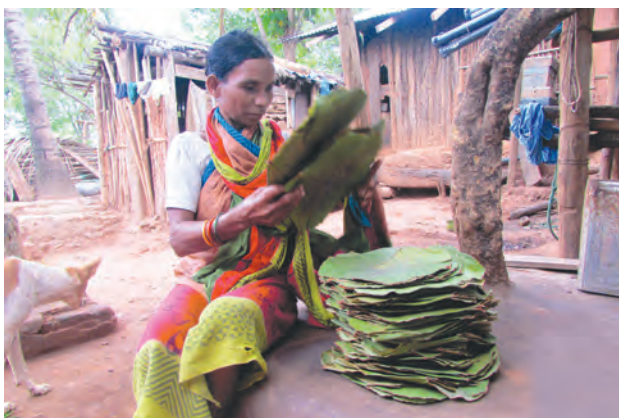
Tribal economic life

Tribal communities are considered as simple societies because their social relationships are primarily based on family and kinship ties. Besides, they do not have any rigid social stratification. They have their own faith systems based on natural phenomenon and beliefs in evil forces. Based on it they have a traditional pantheon of various gods and goddesses. Traditionally, they have had a marginal degree of contact with other cultures and people.