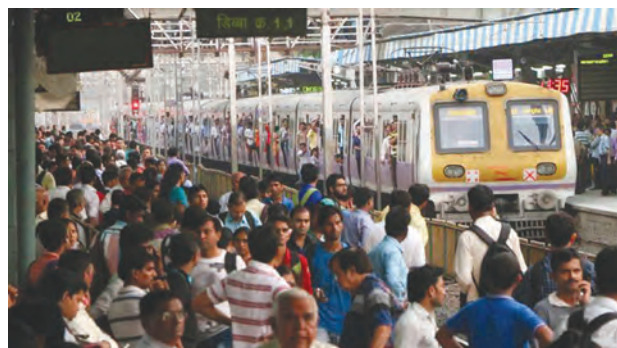
Urban crowded transport

(6) Transport : With traffic bottlenecks and congestion, almost all cities and towns of India are suffering from acute transportation problems. They get worse and more complex as towns grow in size. As towns become larger, even people living within the built-up area have to travel by car or public transport to cross the town. Wherever trade is important, commercial vehicles such as vans and trucks make the problem of traffic more complicated.