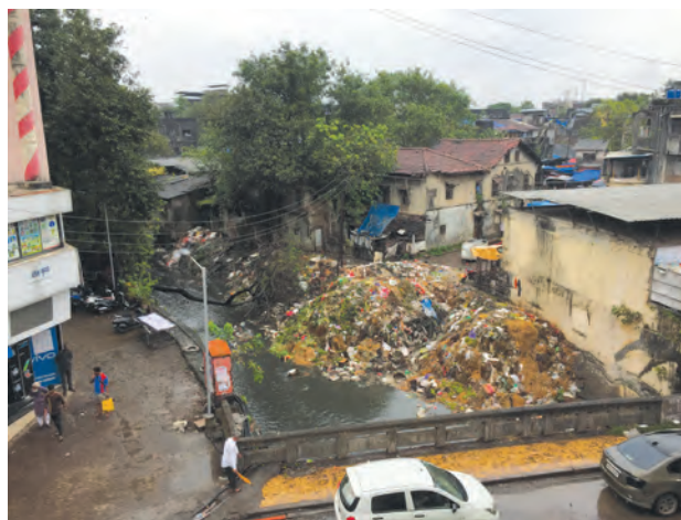
Trash disposal is a problem in cities

(9) Trash disposal : As Indian cities grow in number and size the problem of trash disposal is assuming alarming proportions. Huge quantities of garbage generated by our cities pose serious health hazards. Most cities do not have proper arrangements for garbage disposal and the existing landfills are full to the brim, which become hotbeds of disease and innumerable poisons into the environment. Wastes putrefy in the open, inviting disease-carrying flies, mosquitoes and rats. Also, a poisonous liquid called leachate is emitted, which contaminates ground water. People who live near the rotting garbage and raw sewage fall easy victims to several diseases like dysentery, malaria, plague, jaundice, diarrhea, typhoid, dengue and leptospyrosis.