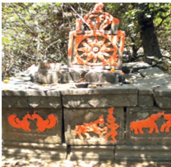
“Suryadev Mandir” (Temple of the Sun God) at Kasatvadi Village, Jawahar Taluka, Dist. Palghar

Each tribe has its own distinct ways of community administration, meant for solving various individual and community issues. They manage the internal community issues through