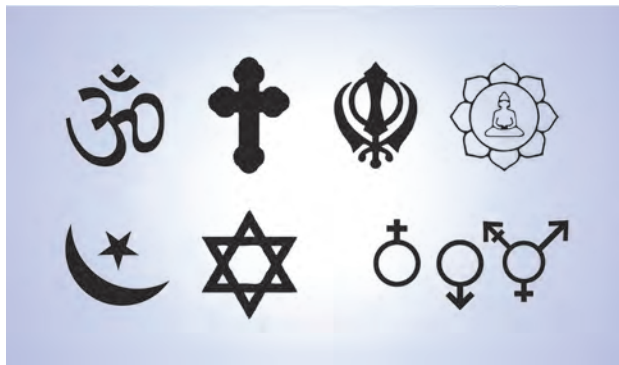
Unity amidst Diversity

India is a country where people from diverse social locations function as a society. It is not as though no conflicts exist. Indian society is characterised by integration of the plural traditions and cultural practices that give it a sense of we-ness. This assimilation of diverse traditions is enabled by the constitutional mandate of India to remain a secular society. There have been phases where the secular nature of Indian society has been questioned. Nonetheless Indian society has demonstrated much accommodation and resilience.