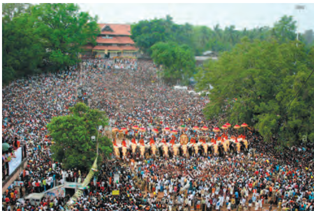
Thrissur Pooram festival (Kerala)

attract lakhs of people of all faiths, year after year. Despite differences of individual religious practice, religious celebrations and days continue to represent the religious unity of this vast country.