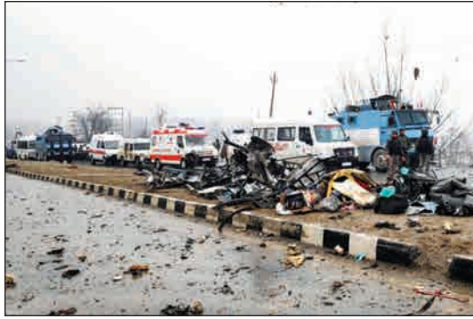
Pulwama Attack: On 14 February 2019