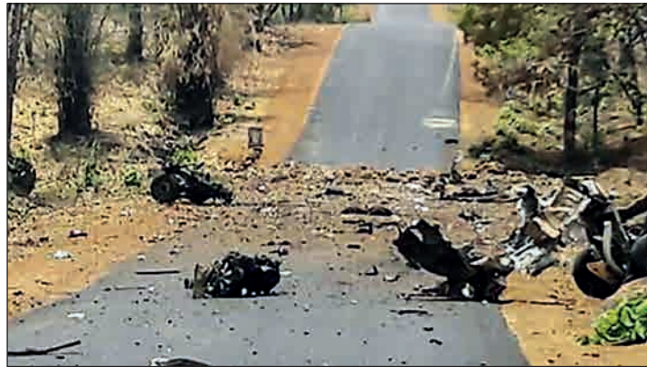
Gadchiroli Attack: On 1 May 2019