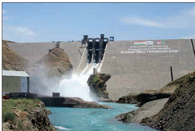
Afghan-India Friendship Dam (AIFD)