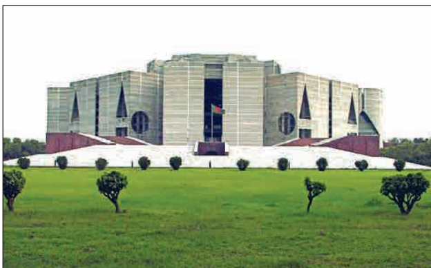
Parliament Building, Dhaka, Bangladesh