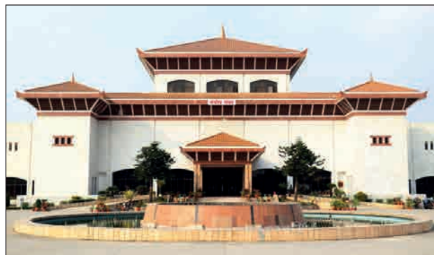
Parliament Building, Kathmandu