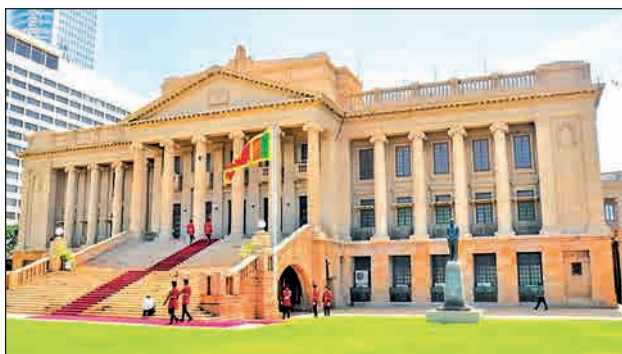
President's Secretariat, Colombo