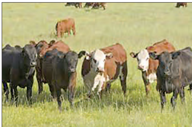
Fig. 3.4 : Grazing heifers