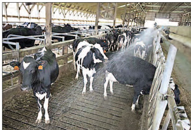
Fig. 3.9 : Foggers and fan arrangement in cattle shed