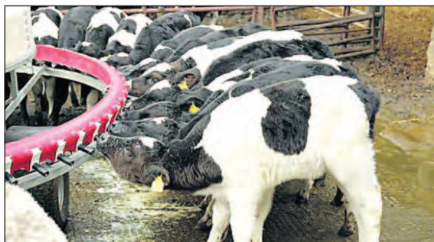
Fig. 3.3 : Nipple feeding