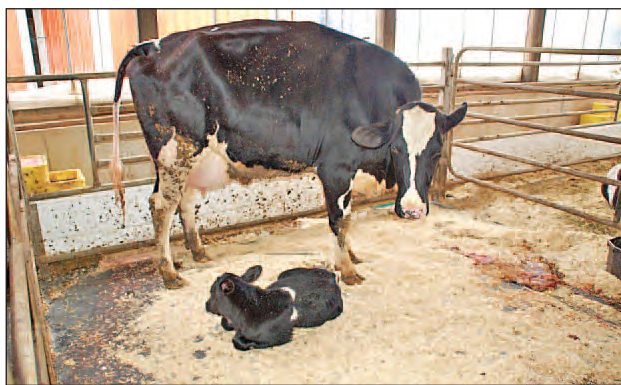
Fig. 3.6 : Newly calved cows