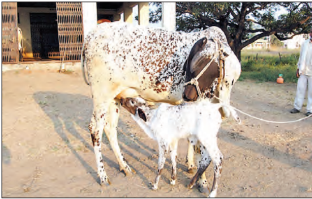
Fig. 3.1 : Suckling method