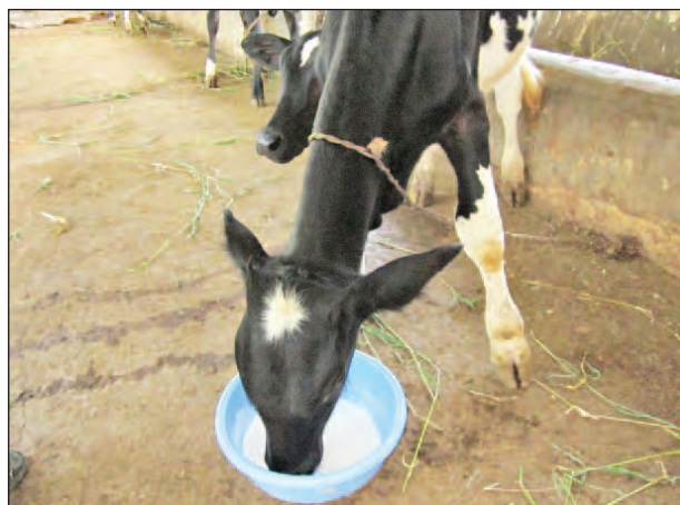
Fig. 3.2 : Pail feeding