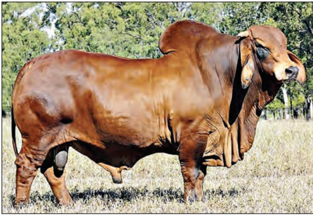
Fig. 3.7 : Sahiwal breeding bull