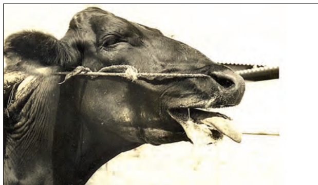
Fig. 3.8 : Signs of heat stress in animal