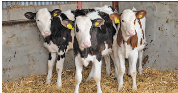
Fig. 3.5 : Stall feeding heifers