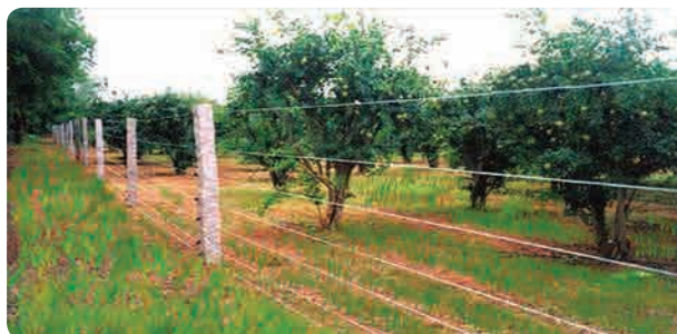
Fig. 5.2 Types of farm fencing

Certain quick growing live hedges serve the purpose of fencing viz. karwand , mehendi , ingadulcis chichbillai , babhol , ketki . These plants are thorny and their leaves withstand drought conditions; propagated easily and put up a rapid growth.