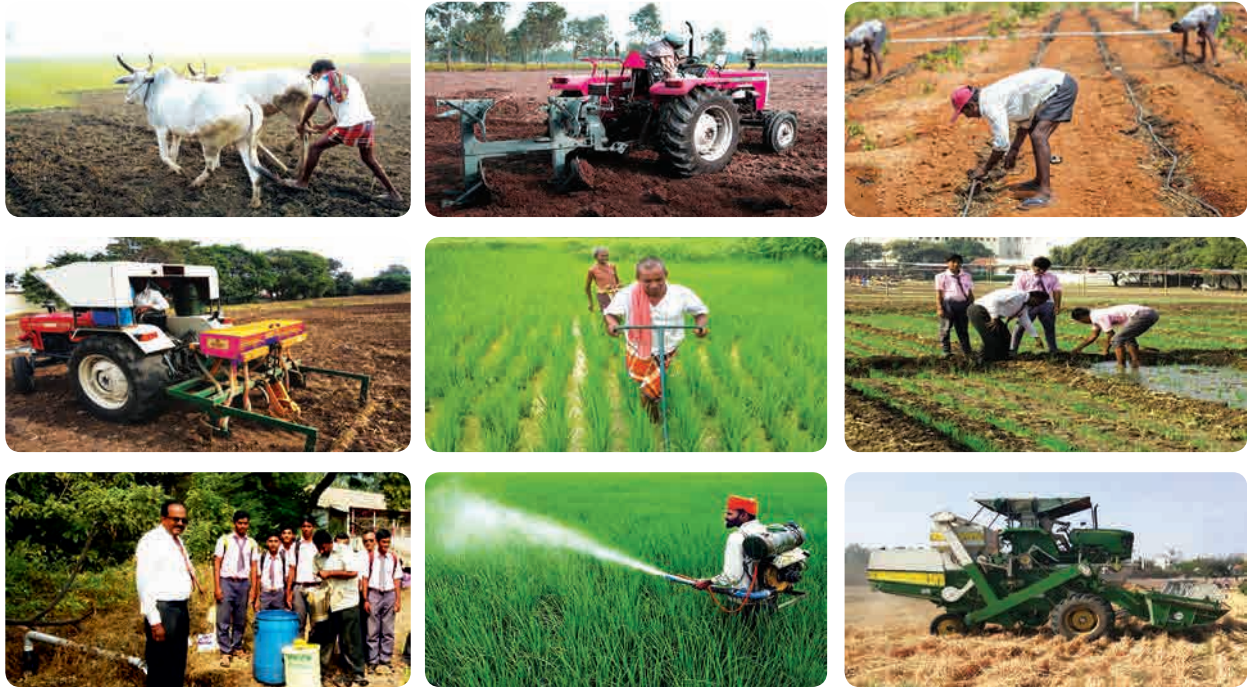
Fig. 5.3 Various farm operations