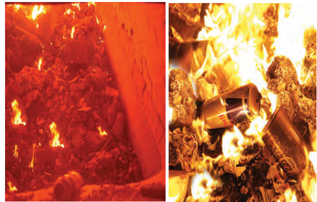
Fig. 10.8: Incineration

7. Incineration: It is the type of waste disposal method in which solid wastes are burned at high temperatures so as to convert all organic matter into gaseous products and inorganic matter into ash. It reduces the volume of solid waste to 20-30% of the original.