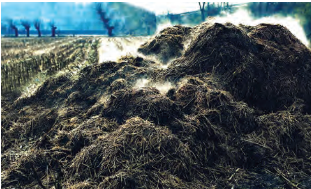
Fig. 10.6: Farm yard manure

4. Farm yard manure: It is the method of composting farm waste. A mixture of dung and urine of animals along with the left over fodder materials, food waste, and kitchen waste is decomposed in a pit. It takes 4-5 months to create manure out of it. It makes available good nutrients for plant growth.