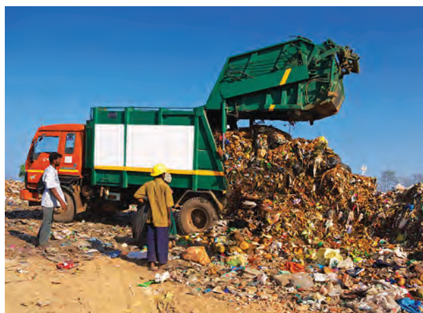
Fig. 10.3: Dumping

it is now being less practiced. It will promote anaerobic fermentation by bacteria and there by the decomposition and disposal is carried out.