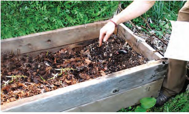
Fig. 10.5: Vermi composting

4. Farm yard manure: It is the method of composting farm waste. A mixture of dung and urine of animals along with the left over fodder materials, food waste, and kitchen waste is decomposed in a pit. It takes 4-5 months to create manure out of it. It makes available good nutrients for plant growth.