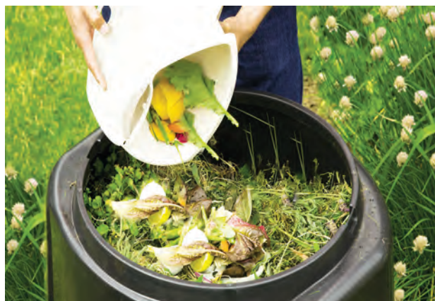
Fig. 10.4: Composting

3. Composting: Composting provides an alternative to landfill disposal of food waste. It requires large areas of land and produces volatile organic compounds. It is natural way of bio-degradation of waste and converting it into a compost which is an organic material that can be used as manure to grow plants. Manure compost (humus) is created by combining food waste with bulking material like fodder waste. It is dark brown or black and has an earthy smell.