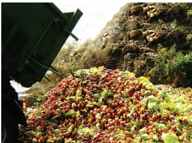
Fig. 10.2: Land filling

1. Landfills: An area of land is selected and it is filled with wastage in a layered manner. The waste is covered with soil or wood chips for layer formation. It is the most easy and economical method. But, landfills give rise to air and water pollution which severally affect the environment.