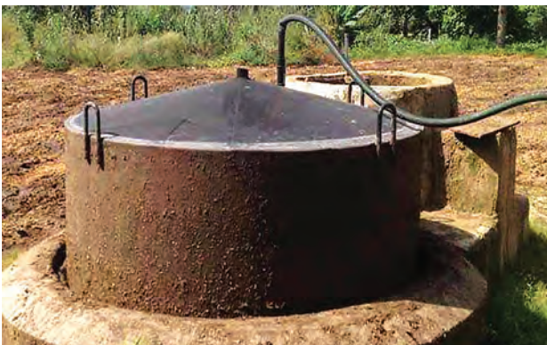
Fig. 10.7: Biogas plant

5. Biogas: The farm waste, food industry waste, municipal wet waste, hotel industry waste, etc. are disposed of by decomposing it along with cow dung in a close chamber (pit) known as biogas plant. During the process, the cellulose material in the waste is decomposed