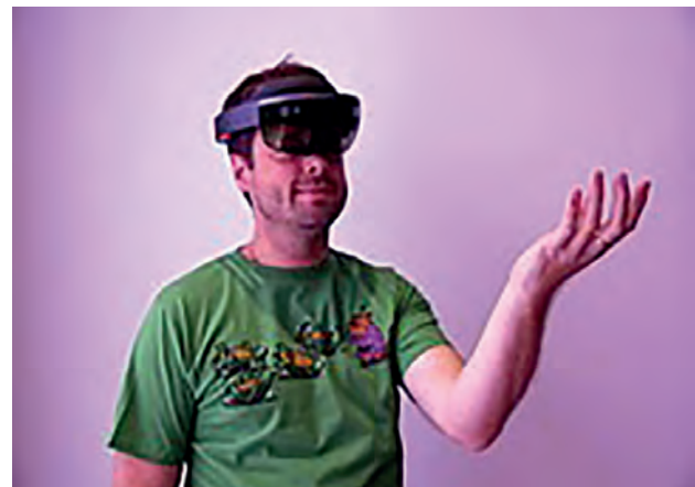
Fig. 4.4 : Person using virtual reality headset

AR displays can be rendered on devices resembling eyeglasses. Versions include eyewear that employs cameras to intercept the real world view and re-display its augmented view through the eyepieces and devices in which the AR imagery is projected through or reflected off the surfaces of the eyewear lens pieces.