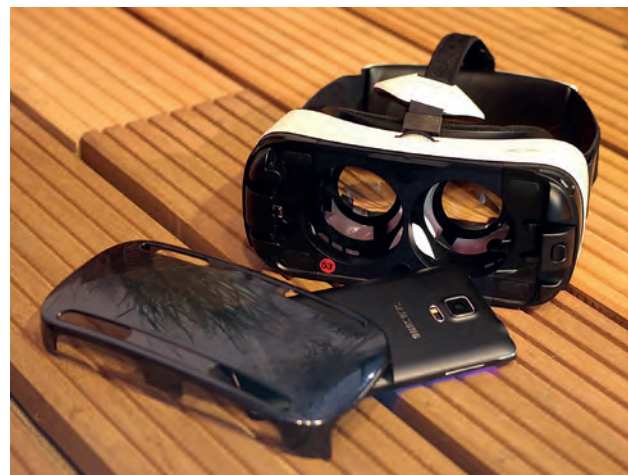
Fig. 4.5 : Image Of Virtual reality headset

The term "virtual" has been used in the computer sense of "not physically existing but made to appear by software" since 1959. One method by which virtual reality can be realized is simulation-based virtual reality. Driving simulators, for example, give the driver on board the impression of actually driving an actual vehicle by predicting vehicular motion caused by driver input and feeding back corresponding visual, motion and audio feedback to the driver.