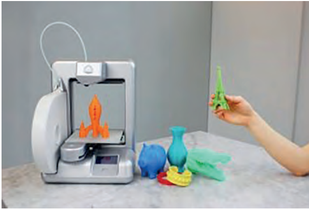
Fig. 4.1 : 3D Printing