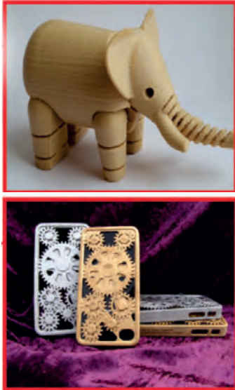
Fig. 4.3 : 3D models

Find out the fields where 3D printing is being used.