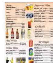
Fig 11.4: Types of menu with their description

Many restaurants offer a beverage and wine menu for their customers. These menus often include specialty wines, teas, coffees, and cocktails. There may be suggestions on which wine best accompanies a particular meal.