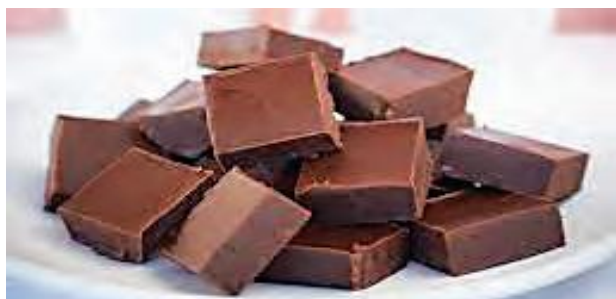
Fig. 5.6 Fudge

Fudge is made by boiling milk, butter and sugar at about 116°C so as to get a soft-ball consistency stage. While cooling the mixture, crystallization of sugar gives a coarse grain to the product. It is also prepared in chocolate flavour by adding 5 to 8 percent of cocoa syrup.