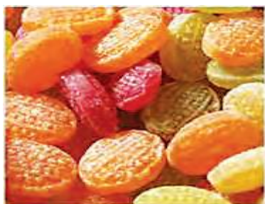
Fig. 5.7 Hard boiled candy

A hard candy, or boiled sweet, is a candy prepared from sugar and liquid glucose boiled to a temperature of about 149-166°C or to the hard-crack stage. After the syrup boiled to this temperature, then it is cooled to form a solid mass containing less than 2 percent moisture. It becomes stiff and brittle as it reaches to room temperature. Within this group a wide variety of products with different colours, flavours and shapes can be get developed. E.g. lollipops, lemon drops, peppermint drops and disks, rock candy, etc.