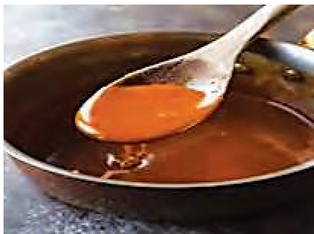
Fig. 5.4 Caramel

Caramels are derived from a mixture of sucrose, glucose syrup, and milk solids. The mixture does not crystallize, thus remains tacky. Caramels are of three types on the basis of temperature of process such as soft (118 to 120°C), medium (121 to 124°C) and hard (128 to 132°C).