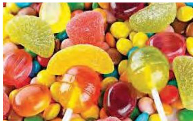
Fig. 5.3 Sugar confectionery

These are the confectionery products mainly made up of sugar added with flavourings and additives. E.g. candy, chocolate, sweet, toffee, etc.