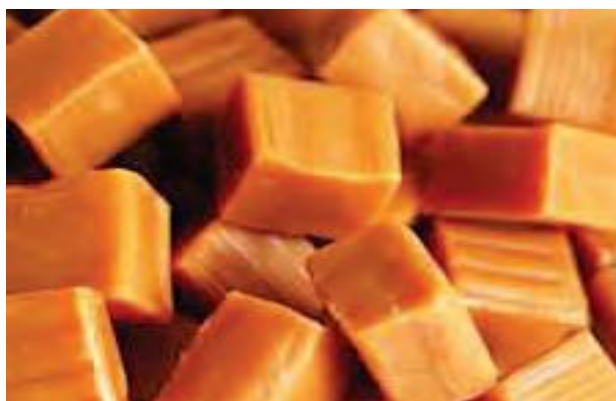
Fig. 5.5 Toffee

Toffee is made by heating process of sugar/jaggery with butter and milk solids. Toffees have lower moisture content than caramels and consequently have a harder texture. The use of fat and milk solid is less than the caramel. The final temperature reaches to about 152°C.