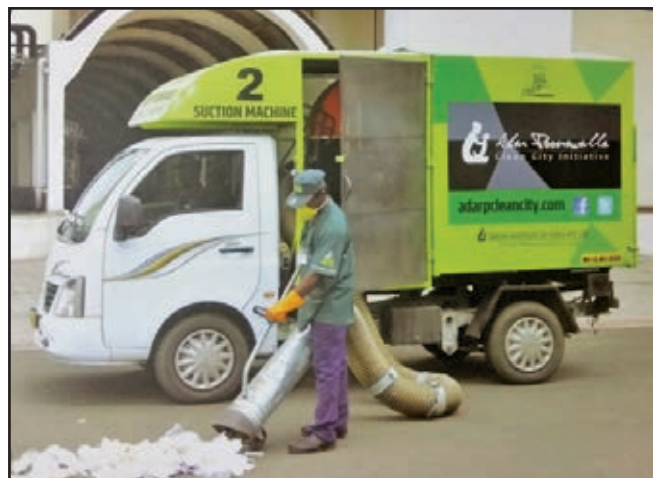
Garbage Collection Machine