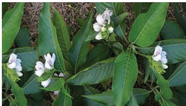
Fig. 15.24 Adulsa

chronic bronchitis and asthma. Leaf juice is given in the treatment of dysentery and diarrhea. Leaves contain vaccine which is expectorant and antiplasmodic.