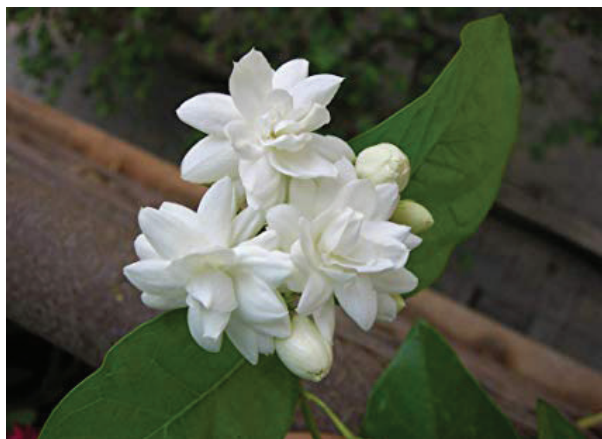
Fig. 15.41 Jasmine

Mogra, Jai, Jui, Chameli are the Important types they are particularly grown for their scented loose flowers Parimullai and Co-2 (Jui) CO-1 (Chameli) Gundumalli, Ramban, Madanban (Mogra)