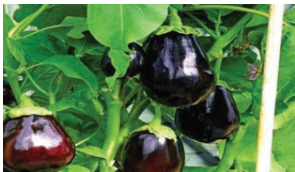
Fig. 15.27 Brinjal

It is one of the most common tropical vegetables grown in India. Many delicious dishes are prepared from fruits. Important varieties – Pusa kranti, manjarigota, Pusa purple long, etc.