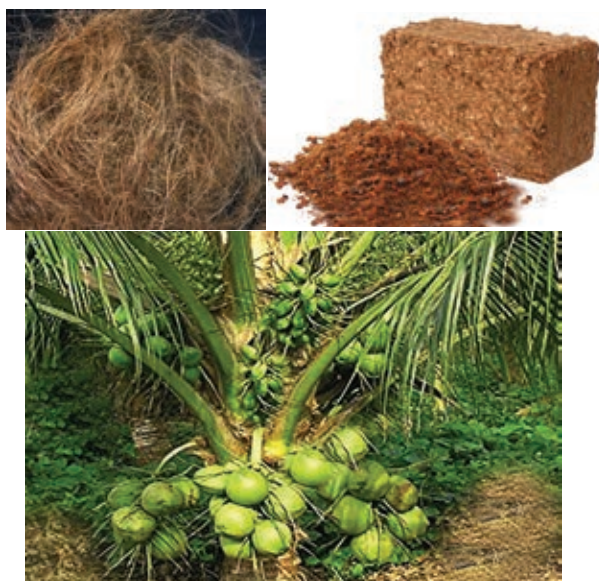
Fig. 15.5 Coconut

because their endosperm contains a large quantity of clear liquid and when immature, may be harvested for their coconut water known as shahale . Mature, ripe coconuts can be used as prasad or nariyal (edible seeds), or processed for oil and coconut milk from the flesh, charcoal (active carbon) from the hard shell, cocopeat and coir from the fibrous husk. Dried coconut flesh is called copra , and the oil derived from it is commonly used in cooking as well as in making soaps and cosmetics. The hard shells, fibrous husks and long pinnate leaves can be used as raw material to make a variety of products for furnishing and decorating, brooms, chatai , etc. The coconut fruit also has cultural and religious significance in certain societies.