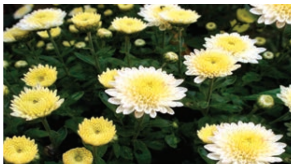
Fig. 15.42 Chrysanthemum

Snowball, Potomal, M-24, Agnishikha, Navneet yellow, Gauri, Pournima, etc.