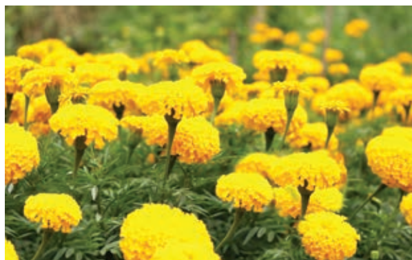
Fig. 15.43 Marigold

Varieties - Giant double, Cracker jack, Charm, Butter scotch, etc.