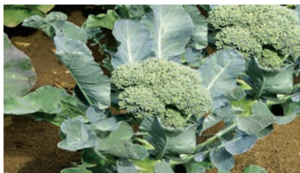
Fig. 15.35 Broccoli

Braccoli is a cruciferous vegetable. It contains high amount of many nutrients, fibre, Vitamin C, Vitamin K, etc. Braccoli also contains more protein than other vegetables. Varieties-Calabrease, Brouzino, etc.