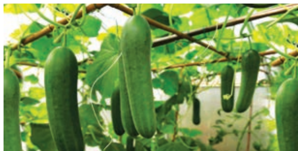
Fig. 15.31 Cucumber

Vine crop grown for its tender fruits which are usually used as salad. The stems are long and trailing. The fruits are elongated and