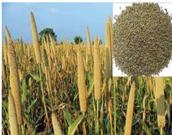
Fig. 15.20 Isabgol

and cool climates and are mainly cultivated in northern India. Fruit, husk and seed coat are used against chronic constipation.