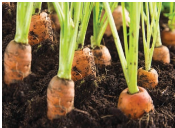
Fig. 15.32 Carrot

Important varieties - Nantes, Pusa yamdagni, Pusa kesar, Chantaney, etc.