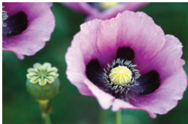
Fig. 15.19 Opium

Latex of unripe fruit contains codeine, morphine used for pain relief. Approximately 12 % of opium latex is made up of analgesic alkaloid morphine which is processed chemically to produce heroin and other synthetic opioids for medical use and for illegal drug trade.