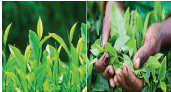
Fig. 15.1 Tea

Tea is an important crop of Assam, Nilgiri, Dargiling and hilly areas of India.