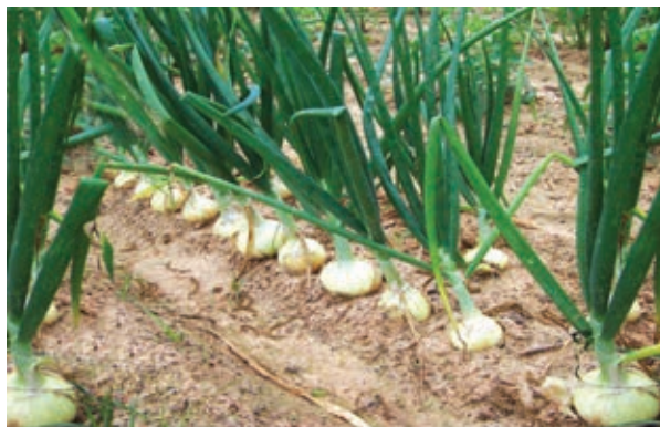
Fig. 15.34 Onion

Varieties – Arka kalyan, Arka Pragati, Baswant-780, N-53, Agrifound desk red, Agrifound light red.