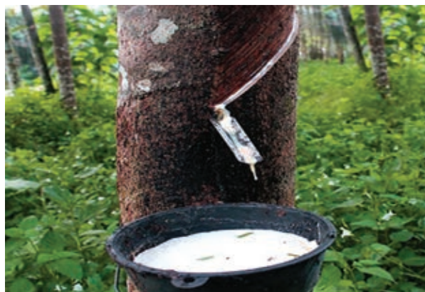
Fig. 15.4 Rubber

Natural rubber, also called Indian rubber, as initially produced, consists of polymers of the organic compound isoprene, with minor impurities of other organic compounds, plus water. Currently, rubber is harvested mainly in the form of the white latex from rubber plant trunk. The latex is a sticky, milky colloid drawn off by making incisions in the bark and collecting the fluid in vessels in a process called "tapping". The latex then is refined into rubber ready for commercial processing. Latex is allowed to coagulate in the collection cup and lumps are collected and processed into dry forms for marketing. Natural rubber is used extensively in many applications.