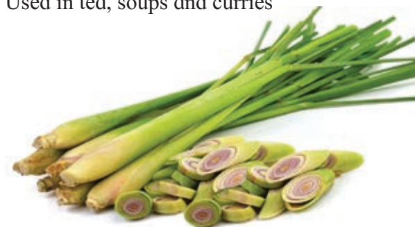
Fig. 15.23 Lemon grass