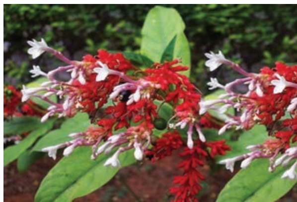
Fig. 15.22 Sarpagandha

Roots contain alkaloids like reserpine, serpentinine. Antidote for snake bite and medicine for blood pressure. Reserpine is an alkaloid first isolated from R. serpentina and was widely used as an antihypertensive drug. It had drastic psychological side effects and has been replaced as a first-line antihypertensive drug by other compounds that lack such adverse effects, although combination drugs that include it are still available in some countries as second-line antihypertensive drugs..