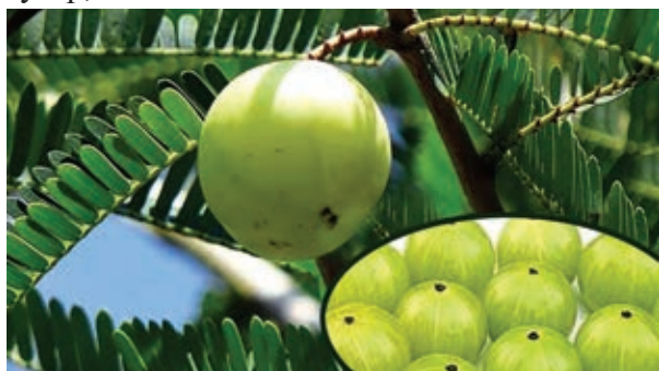
Fig. 15.25 Amla

After ripening the berries are harvested by hand. The taste is sour, bitter and astringent and it is quite fibrous in nature. Indian gooseberry is a common constituent, and most notably is the primary ingredient in an ancient herbal Chyawanprash. The fruit is commonly pickled with salt, oil, and spices. Murambah, a sweet dish is made by soaking the berries in sugar syrup until they are candied. It is traditionally consumed after meals. Popularly used in inks, shampoos and hair oils. Fruit contains large quantity of Vitamin C (600 mg/ 100 g) and is used against cough, cold and as a laxative in hyperacidity. Amla fruit is commonly used squash, juice, syrup, and crush.