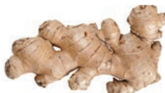
Fig. 15.9 Ginger

Ginger originated in Island Southeast Asia. Ginger produces a hot, pungent fragrant taste. Young ginger rhizomes are juicy and fleshy with a mild pungent taste due to gingerol. They are often pickled in vinegar. They can be steeped in boiling water to make ginger herb tea. Ginger can be made into candy or ginger wine. Ginger sets are dried into 'sunth', powder, ginger oil and oleo-resin. Ginger essence is used in pharmaceutical products.