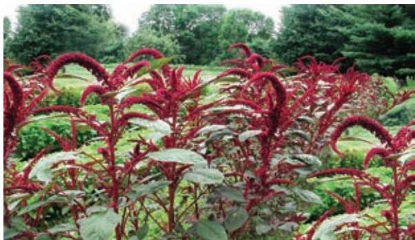
Fig. 15.33 Amaranthus

Important varieties - Chhoti Chaulai, Badi chaulai.