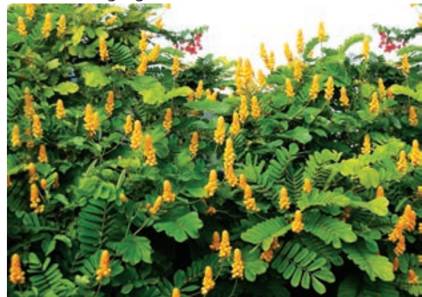
Fig. 15.16 Senna

Senna is a large genus of flowering plants in the legume family .This diverse genus is native throughout the tropics, with a small number of species in temperate regions. The leaves of senna plant are used in tea hot drink and may help to relieve constipation. Some senna species are used as ornamental plants in landscaping. The plant is adapted to many climate types. Cassia gum, an extract of the seeds of Chinese senna is used as a thickening agent.