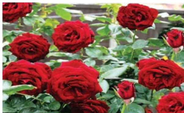
Fig. 15.40 Rose

Varieties-Gladiator, Superstar, Double delight Devine, Dekore, etc.