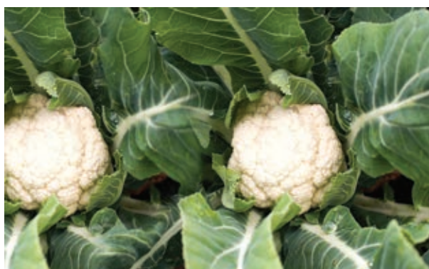
Fig. 15.27 Cauliflower

Important varieties – Early kunwari, Pusa synthetic, Pusa sharad, Pant shubhra, Pusa shubhra, etc.