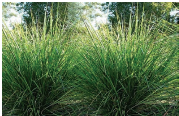
Fig. 15.18 Khus

Khus is a perennial bunch grass native to India. The plant helps to stabilize soil and protects from erosion, but it can also protect fields against pests and weeds. It is also used as animal feed. Its spongy branched fine rootlets contain fragrant oil. Oil is extracted and used for cosmetics, aromatherapy, herbal skin care and ayurvedic soap. Due to its fibrous properties, the plant can also be used for handicrafts, ropes, food and flavourings, perfumery, etc.