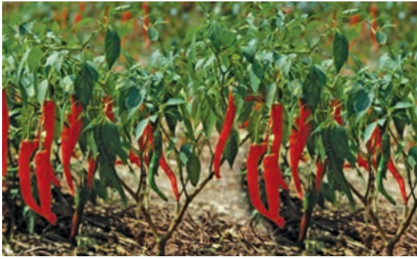
Fig. 15.14 Chilli