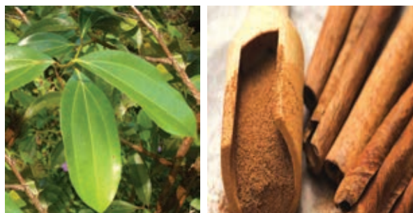
Fig. 15.12 Cinnamon

Cinnamon is a spice obtained from the inner bark of a perennial shrub. Cinnamon is used mainly as an aromatic condiment and flavouring spice additive. The aroma and flavour of cinnamon is derived from its essential oil and principal component, cinnamaldehyde, as well as numerous other chemical constituents, including eugenol.