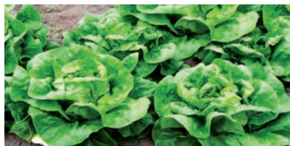
Fig. 15.39 Lettuce

Varieties - Great lakes, Chinese yellow, slobalt, etc.