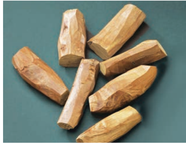
Fig. 15.15 Sandalwood

milky precious wood scent. Used in perfume, acts as finative, cosmetic and soap industry Sandalwood oil prices have risen to Rs 1.4 lakh per kg.