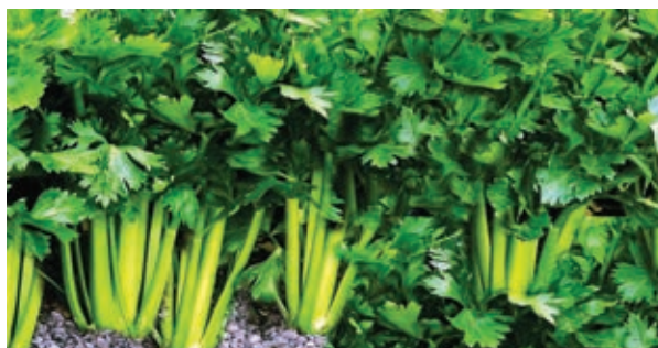
Fig. 15.38 Celery

Varieties - standard bearer, weigh grove giant, etc.