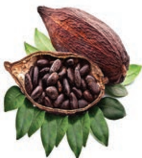
Fig. 15.3 Cocoa