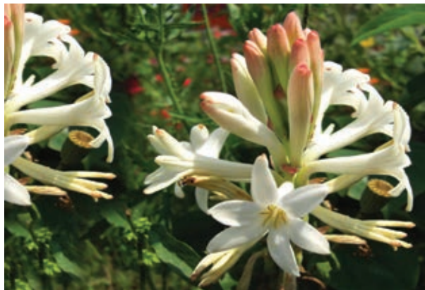
Fig. 15.44 Tube Rose

Varieties - Arka Nirantara, Shringar, Prajwal, Kalyani double, Vaibhav, Pearl, Svasini, etc.