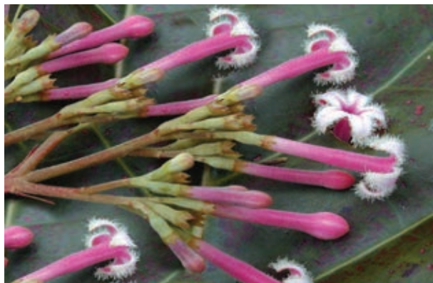
Fig. 15.17 Geranium

geraniums) and the garden plants are called geraniums, which modern botany classifies as genus pelargonium , along with other related genera. The oil of geranium has a refreshingly delicate rose like aroma. As such itself is a perfume.