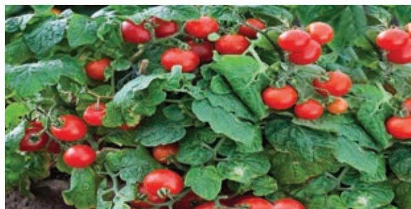
Fig. 15.26 Tomato

Important varieties – Arka sourabh, Arka vikas, Sl -120, Pusa early dwarf, Pusa rubi, etc.