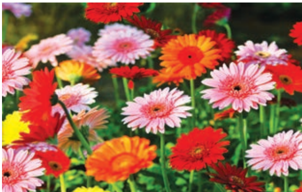
Fig. 15.45 Gerbera

Varieties -Ruby red, Dusty, Shania, Superniva, Maria, Black jack, etc.