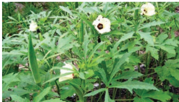
Fig. 15.29 Okra

The crop is cultivated for its young tender fruits. It is major vegetable crop, available round the year having high export potential. Important varieties Arka anamika, Pusa makhamali, Parbhani kranti, Pusa sawani, etc.