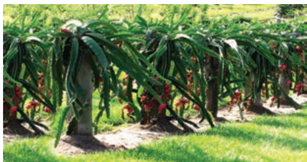
Fig. 15.37 Dragon fruit

Dragon fruit is very strange looking fruit. The dragon fruit is also known as a pitahaya or pitaya. Dragon fruit plant sowing is excellent in the less rainfall areas. Varieties - Pitaya rosa, pitaya blanca, etc.