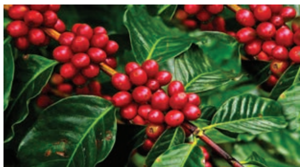
Fig. 15.2 Coffee

All coffee plant species are woody evergreens, but the plants range in size from small shrubs to trees more than 10 meters tall. Leaves vary in colour from yellowish to dark green, with touches of bronze or purple. The plant produces white flowers and red berries or “cherries” that contain seeds. Most coffee berries contain two seeds, which are known as “beans”. Beans are harvested from matured fruit, dried and powdered and used to make coffee beverage. Coffee is one of the important crops of Karnataka.