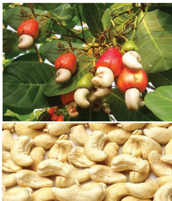
Fig. 15.7 Cashew nut

The cashew nut, often simply called a cashew, is widely consumed. It is eaten on its own, used in recipes, or processed into cashew cheese or cashew butter. The shell of the cashew seed yields derivatives that can be used in many applications including lubricants, waterproofing, paints, and arms production. The cashew apple has a light reddish to yellow colour. It's pulp can be processed into a light sweet, astringent fruit drink or distilled into liquor (called fenny in Goa). Cashew nut is known as dollar earning crop. India is the world's leading producer and exporter of cashew kernels.