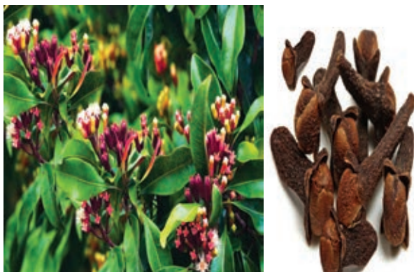
Fig. 15.13 Clove

Cloves is native to India grown in South India. Clove flower buds are used as a spice in India. It is an evergreen tree of humid tropical climate and hilly tract of the Western Ghats and the red soils are best suitable for clove cultivation. A major component of clove taste is imparted by the chemical compound eugenol and it is used in traditional medicines. The clove oil is effective for toothache pains or other types of pains related health problems. It is widely used in all types of masala preparations.