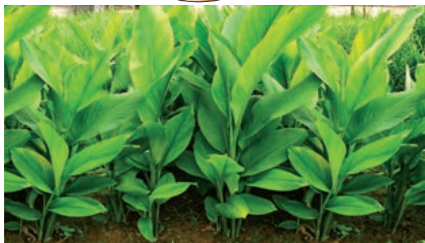
Fig. 15.11 Turmeric