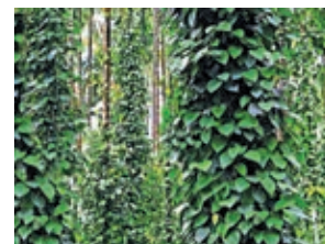
Fig. 15.9 Black pepper