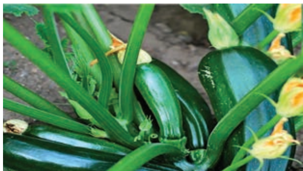
Fig. 15.36 Zucchini

It is known as type of summer squash which can reach nearly 1 m in length. It is usually harvested when still immature. Some cultivars have dark green or deep yellow colour. Varieties - Raven, Bush baby, Black beauty, faudbook, etc.