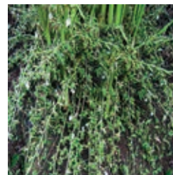
Fig. 15.8 Cardamom