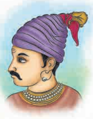
Chhatrapati Rajaram Maharaj

While leaving for Jinji, Rajaram Maharaj entrusted Ramchandrapant Amatya, Shankaraji Narayan Sachiv, Santaji Ghorpade and Dhanaji Jadhav with the responsibility of defending Raigad. The guerrilla tactics of Santaji and Dhanaji proved the large scale artillery and huge cannons of the Mughals to be of little use. Despite of holding very few assets the Marathas continued to create havoc for the Mughals. Rajaram Maharaj safeguarded Swarajya in these trying times. This was a great task in itself and a great success of Rajaram Maharaj.