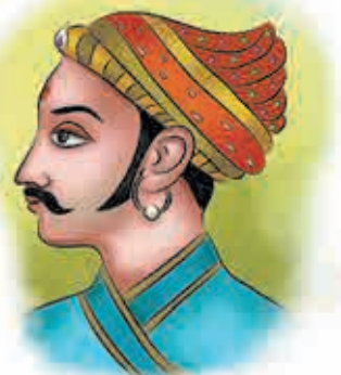
Chhatrapati Shahu Maharaj

The Mughals continued their efforts to defeat the Marathas, even after the death of Aurangzeb. For that purpose they adopted the strategy of dividing the Marathas. They released Shahu Maharaj from captivity in 1707 C.E. After his release there was a conflict between Maharani Tarabai and Shahu Maharaj. Shahu Maharaj won the ensuing battle. Balaji Vishwanath played an important role on behalf of Shahu Maharaj and later he was appointed as Peshwa.