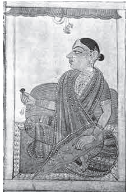
Miniature painting - Maratha period

singing of Bhajans were popular. Powadas (Ballads) were composed during this period to encourage the spirit of heroism among the people. The ballads known as 'powadas' and 'katavas', composed by the Shahirs were the types of historical poetry. The powadas