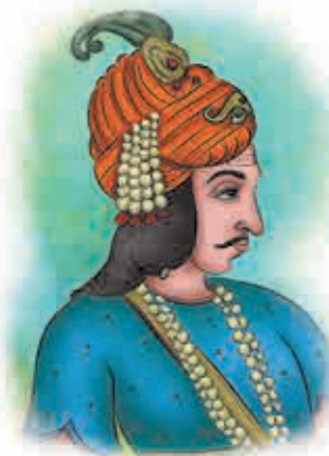
Bajirao Peshwa I

Nanasaheb was appointed as the Peshwa. Meanwhile, the Marathas were defeated in the third battle of Panipat. The Maratha rule became weak. Madhavrao Peshwa tried to re-establish the Maratha power. The defeat in Panipat was not just a political defeat but it also lowered the morale of the Marathas greatly.