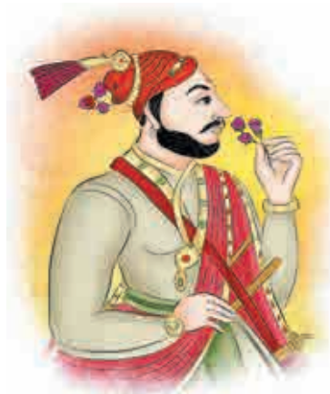
Chhatrapati Sambhaji Maharaj

After the death of Chhatrapati Shivaji Maharaj, Chhatrapati Sambhaji Maharaj was coronated as the king of Swarajya. During his reign, a constant conflict continued with the Mughal emperor Aurangzeb. Aurangzeb's rebellious son Akbar had established friendly relations with Sambhaji Maharaj. Enraged by