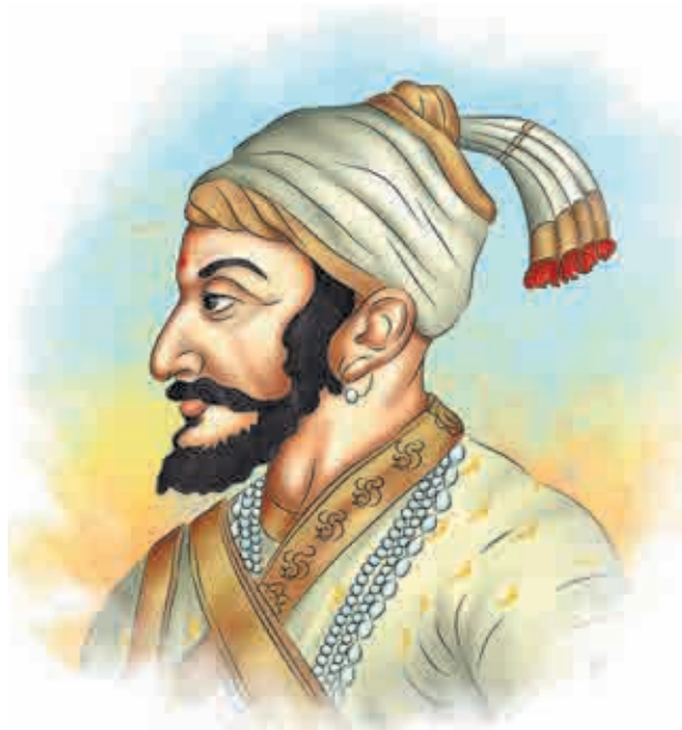
Chhatrapati Shivaji Maharaj