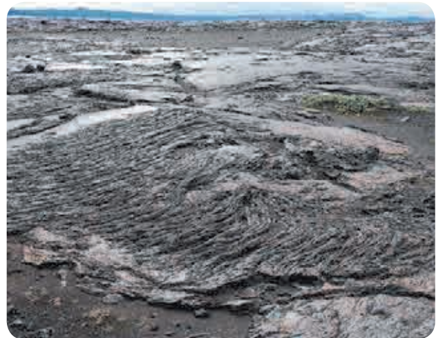
Fig. 6.4 : Ropy Lava

accessory amount of biotite and hornblende. Olivine may or may not be present. It shows compact, vesicular, amygdaloidal, pipe amygdaloidal, pillow and columnar structure. The cavities in vesicular basalts are filled with secondary minerals like heulandite stilbite, apophyllite, quartz, amethyst, chalcedony, agate, jasper, opal, calcite etc. Ropy lava structure, columnar joints are commonly observed in basalts (Fig.6.4 and 6.5).