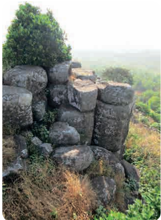
Fig. 6.5 : Columnar joints, Tumzai Hills, Panhala