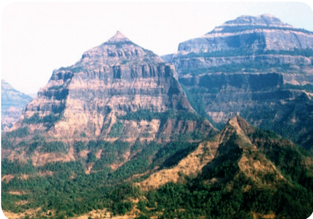
Fig. 6.3 : Stratigraphic exposures of lava flows in Malshej Ghat area of Maharashtra

districts in Vidarbha region and Ratnagiri and Sindhudurg districts in coastal Konkan. Two types of lava flows are recognized. They are the pahoehoe or ropy lava and the ‘aa’ or blocky lava. Pahoehoe lava flows predominate in Dhule, Aurangabad, Pune and Nasik districts, whereas in rest of Maharashtra, ‘aa’ lava flows are dominantly exposed. In Maharashtra between some flows intertrappean beds of lacustrine origin are found. Red bole beds commonly occur in between two lava flows. The flows are intruded by number of dolerite dykes trending nearly N-S, parallel to the west coast. East-west trending dykes are commonly exposed in northern part of Maharashtra around Nandurbar, Dhule and Jalgaon districts.