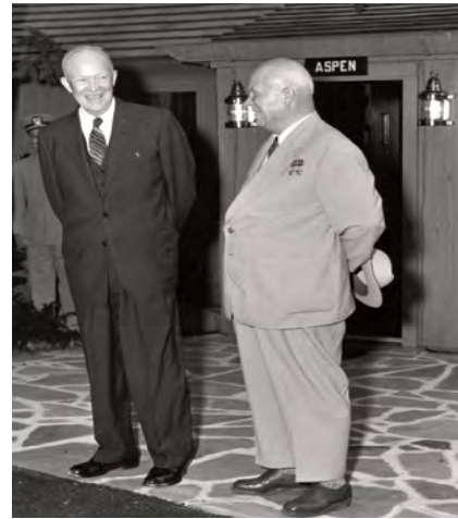
President Dwight Eisenhower of the US and Prime Minister Nikita Khrushchev of the Soviet Union at Camp David (1959)

seeking a dialogue between the two cold war rivals.