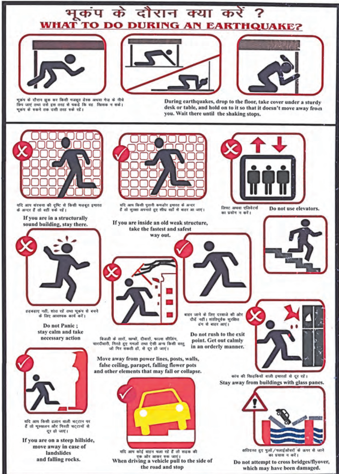
Figure 5.4 : What to do during an earthquake