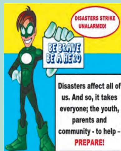
Figure 5.10: The Disaster Emergency Kit