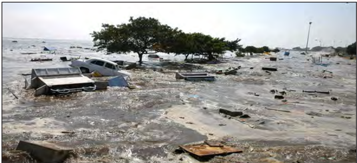
Figure 5.7 : A general view of the scene of Marina beach in Chennai, India, On December 26, 2004, after tsunami wave hit the region. Waves devastated the southern Indian coasttime killing an estimated 18,000 People.