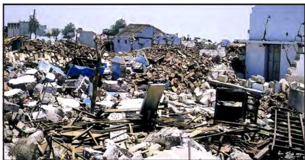
Figure 5.2 :The Bhuj earthquake 26 th January,2001

Earthquakes in Maharashtra show major alignment along the west coast and Western Ghats region. Seismic activity can be seen near Ratnagiri, along the western coast, Koyna Nagar and Thane district.