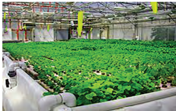
Fig 3.4 : Static solution culture

In static solution culture, media solution is stable in the container. Particular level is maintained to keep some of the roots exposed in air for availability of oxygen or the solution may be aerated by using aquarium aeration pump system. When concentration of nutrients in the solution is decreased, new solution is added or previous one is replaced periodically. Static solution hydroponic method is generally followed for home scale or small units.