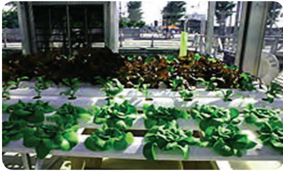
Fig. 3.5 : The nutrient film technique being used to grow various salad greens