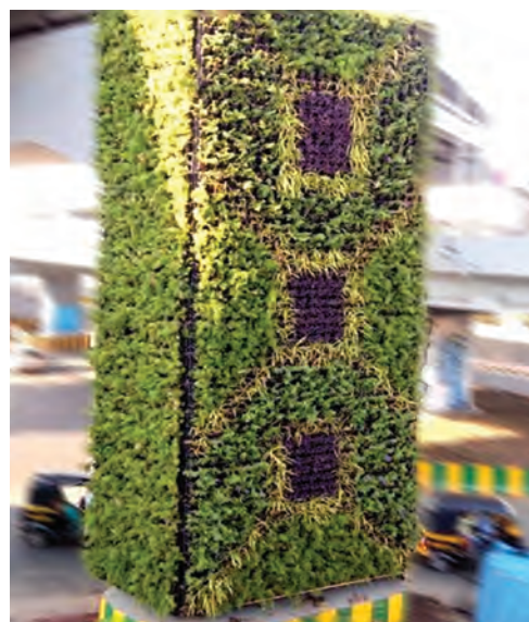
Fig 3.3 : Vertical garden