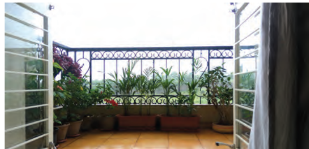
Fig 3.2 : Terrace garden

Because of crowding, pollution and hectic lifestyle, urban people are always in search of a hobby which can give scope for their creativeness and feel pleasure. Most of them have affection towards agriculture. But they have no agricultural land or other facilities. Novel concept of vertical gardening allows such people to grow flowers, vegetables and fruits also in their balconies, terrace, common places, etc. Use of cocopeat, hydroponics and aeroponic technologies are also adopted in urban agriculture. Municipal corporations, railway, corporate buildings, apartments, etc. are now covering their walls, pillars and terrace by vegetation. Here cocopeat is used as media for growing, as it is light in weight and having higher water holding capacity. Vertical gardens are expensive as compared with ground-level gardens. It requires panels and framework, specially designed pots, irrigation system and maintenance.