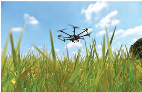
Fig 3.1 : Use of drone for spraying operation

Foliar application of inputs like pesticides, fertilizers, growth regulators, weedicides, etc. is not only expensive but also full of risk for the operators. Restrictions in spraying due to wet soil, densely populated crops like sugarcane, can be overcome by the use of drones. Drones may be operated by remote control or by programming with GPS parameters. It is going to be a new opportunity of employment to provide drones on rent or contractual system.